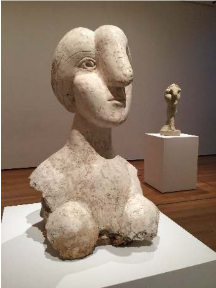
Bust of a Woman , (1931).

over ten different media –among them wood, plaster, sheet, metal, clay, bleach-smoothed pebbles- this exhibition seems to arise high passions in the laymen as much as in high-end collectors familiar with his work. A good example of this is the sculpture made after Marie-Thérèse Walter, Bust of a Woman -one of the masterpieces in this exhibition- which could not be more fetching.