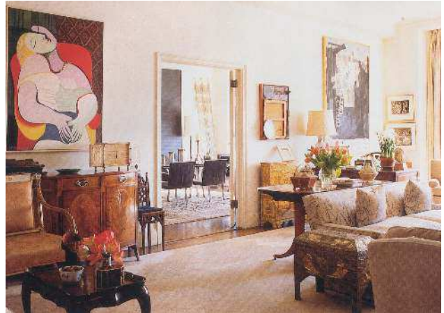
Right: Picasso's painting, Le Reve at Victor and Sally Ganz's living room at their apartment located at 10 Gracie Square.